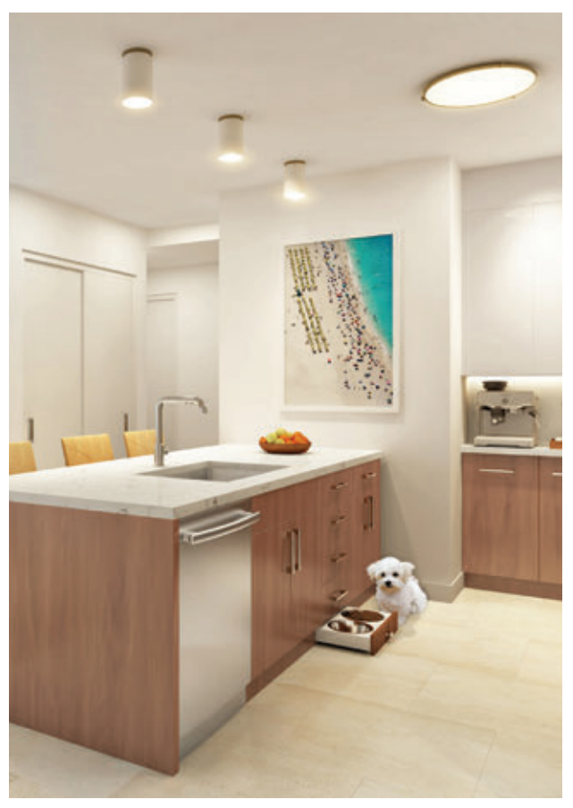
ARTIST'S RENDERING | TYPE A-4 KITCHEN & PET BOWL FEATURE

Your kitchen further enhances the convenience of your new daily life. With state-of-the-art appliances and custom designed cabinetry, you're surrounded by quality you know you can trust for years to come. By seamlessly combining natural textures and materials with clean lines, your new home is a modern-day take on island-style living.