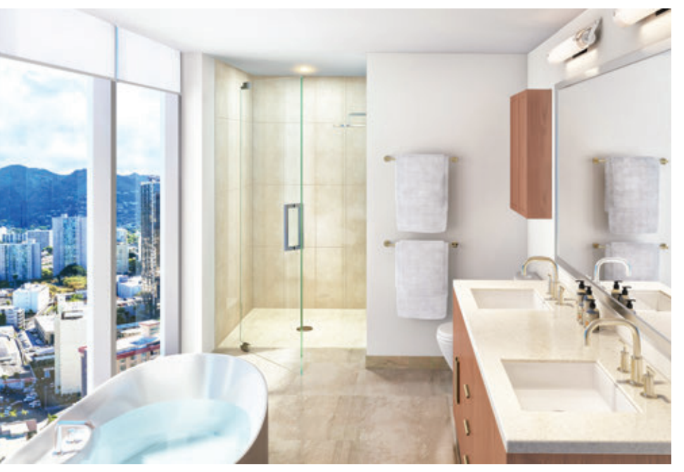
ARTIST'S RENDERING | TYPE A-4 MASTER BATHROOM | LEVEL 26